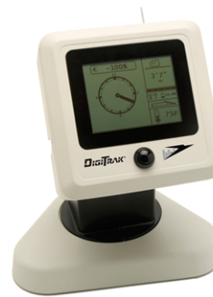
Falcon Compact Display