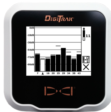
Falcon Frequency Optimizer