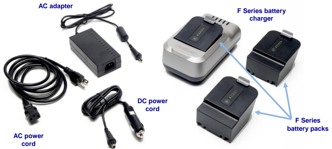
F Series Battery Charger and Li-Ion FBP Batteries

The DigiTrak® F Series™ Battery Charger (FBC) includes AC and DC power cords and an AC adapter. Rechargeable lithium-ion (li-ion) F Series battery packs (FBP) are included with a complete locating system and also sold separately. The battery packs power all current DigiTrak receivers and battery-operated remote displays. The FBC battery charger can operate from AC (100–240 V, 50–60 Hz, 1.5 A max.) or DC (10–28 V, 5 A max.) power sources. The AC power cord provided with your charger is standard to your global region.