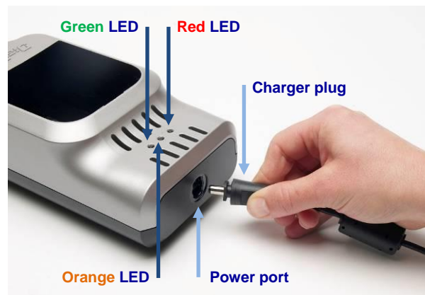
Inserting Charger Plug into Power Port

Install either the AC adapter or the DC power cord by inserting the charger plug into the power port of the battery charger and then rotating it a quarter turn in either direction to lock it in place.